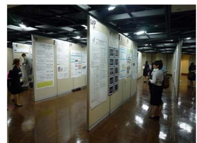
Fig.2 Poster Session Room D